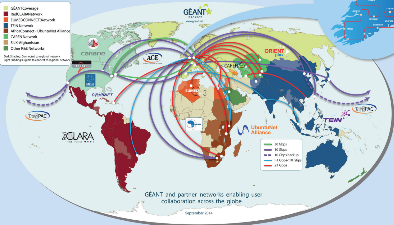
GÉANT and partner networks enabling user collaboration across the globe